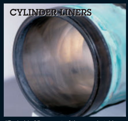
"Probably 95 percent of the crosshatching is still in the liners. No scuffing, no cavitation in the liners. The liners could be reused in the condition they're in." – Independent engine rater