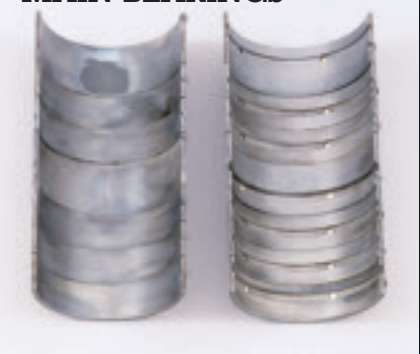
"Light wear. They compare to [those in] an engine that had 15,000- to 20,000-mile [petroleum] oil and filter changes."