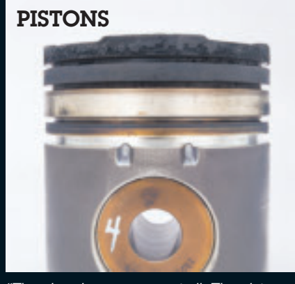
"The pins show no wear at all. The piston crowns and lands show a normal amount of carbon. The skirts are very clean with a few fine vertical lines."

Except for normal top polishing on the push tubes the rater found, "no wear to speak of. These can go right back in the engine and be used again." The push tubes were put back into the engine and are in use today.