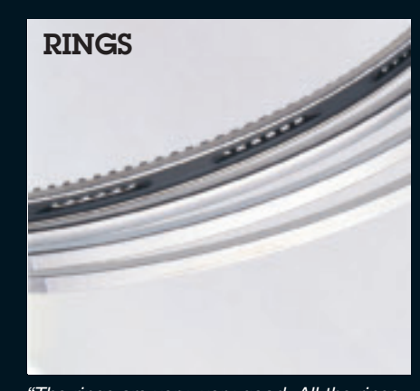
"The rings are very, very good. All the rings are free. None are broken. No plugging whatsoever in the oil rings."