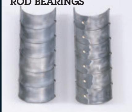
"Minimal wear. These, too, compare to [those in] an engine that had 15,000- to 20,000-mile [petroleum] oil and filter changes."